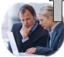
Plant Manager / Corporate EHS