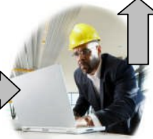
Facility EHS coordinator and/or Operations