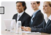
Executive and/or Council