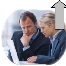
Plant Manager / Corporate EHS