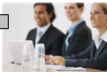
Executive and/or Council