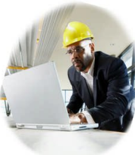
Facility EHS coordinator and/or Operations