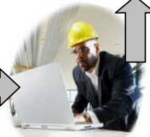
Facility EHS coordinator and/or Operations